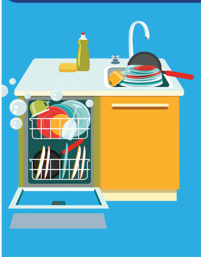
Typical residential water use